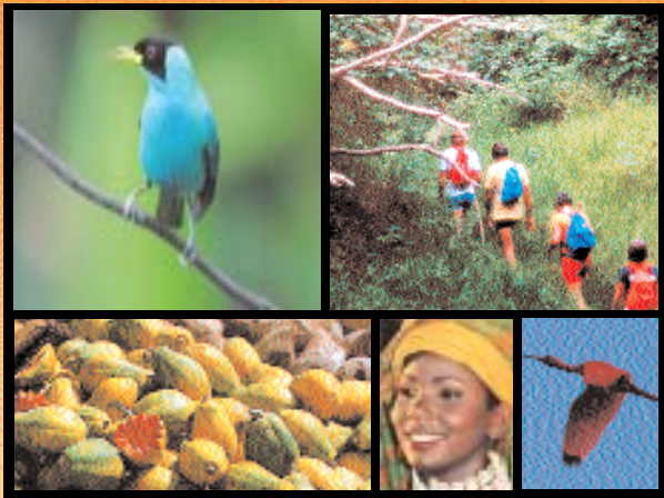
Photos this page, clockwise: Green Honeycreeper (photo by Tom Merigan); hiking in Trinidad; market produce: a local islander; Scarlet Ibis (photo by Tom Merigan) Cover photos: Phalaenopsis; White-tailed Trogon (photo by Tom Merigan); Great Egrets: a beach in Trinidad

Siemer & Hand Travel 750 Battery Street, Suite 300 San Francisco, CA 94111