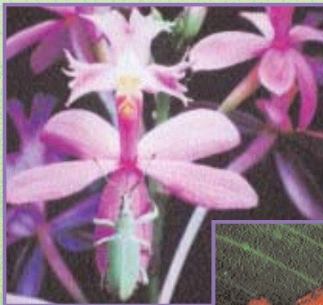
A weevil on an orchid

Our first stop today is the lowland Aripo Savannah en route to the eastern coast and Nariva Swamp, the island's largest freshwater herbaceous swamp. In this area of extremely acidic soil with poor drainage, we search for new species including Orange-winged Parrot and Squirrel Cuckoo. Continue to Nariva Swamp, where islands of Moriche Palm line its banks. During our journey we hope to see species such as Savannah Hawk, Red-breasted Blackbird, Southern Lapwing, White-headed Marsh-Tyrant, and Green-rumped Parrotlet. At the marsh we look for Pinneated Bittern, Pearl Kite, Wattled Jacana, Blue and Yellow Macaw, and Crimson-crested Woodpecker. We may also glimpse Red Howler and Capuchin monkeys and Giant Anaconda in the forest. At dusk, we wait to see flocks of Red-bellied Macaws returning to their nighttime roosts.