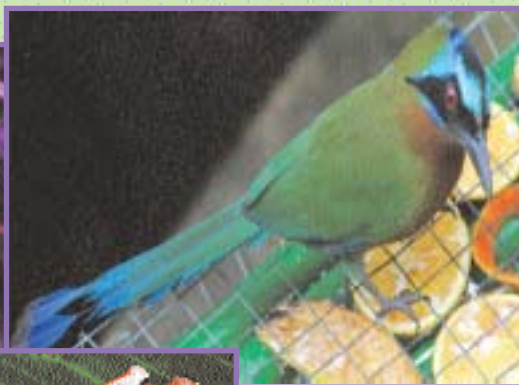
A Blue-crowned Motmot feeds at the Asa Wright Centre