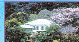
Asa Wright Centre

The Asa Wright Nature Centre and Lodge is a beautiful 24-room lodge and wildlife sanctuary located in the midst of a lush rain forest in northern Trinidad. Formerly the estate house of the former plantation, the centre's main lodge is a gathering place for guests throughout the day and evening, and the lodge's verandah offers up-close viewing of an incredible variety of birds that live in the surrounding rainforest. Guests also enjoy high tea in the afternoon and complimentary rum cocktails in the evening as the sun sets over the Arima Valley. Guest accommodations are comfortable twin-bedded rooms, each with a private bath. The centre has a natural grotto on a free-running rainforest stream, providing a relaxing escape from the tropical heat. Delicious meals reflect the diversity of the local cuisine, which is a mix of West Indian, Creole, Oriental, Indian, and European dishes, and served family-style in the centre's dining area.