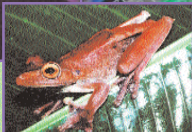
Giant Tree Frog