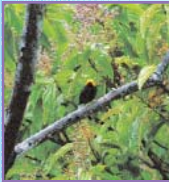
Top: Purple Honeycreeper Below: Golden-headed Manikin

Oilbird, the only nocturnal fruit-eating avian species in the world that uses sonar to find their way through the forest and into caves. Other creatures